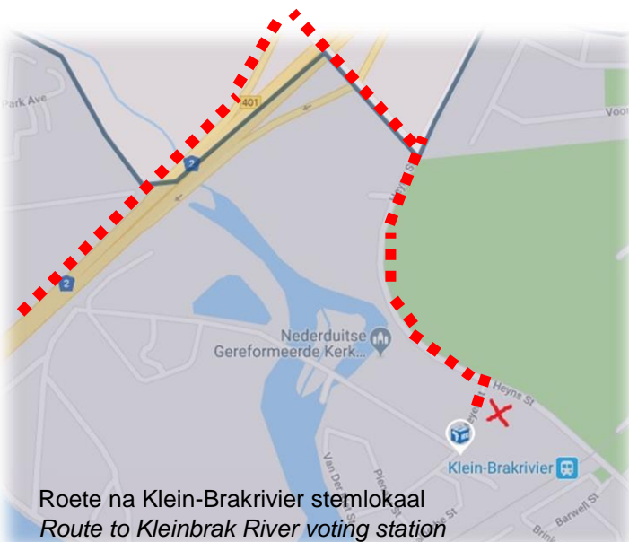
Roete na Klein-Brakrivier stemlokaal Route to Kleinbrak River voting station

Maak seker van jou stemstatus en stemlokaal by https://www.elections.org.za/IECOnline/My-Registration-Status